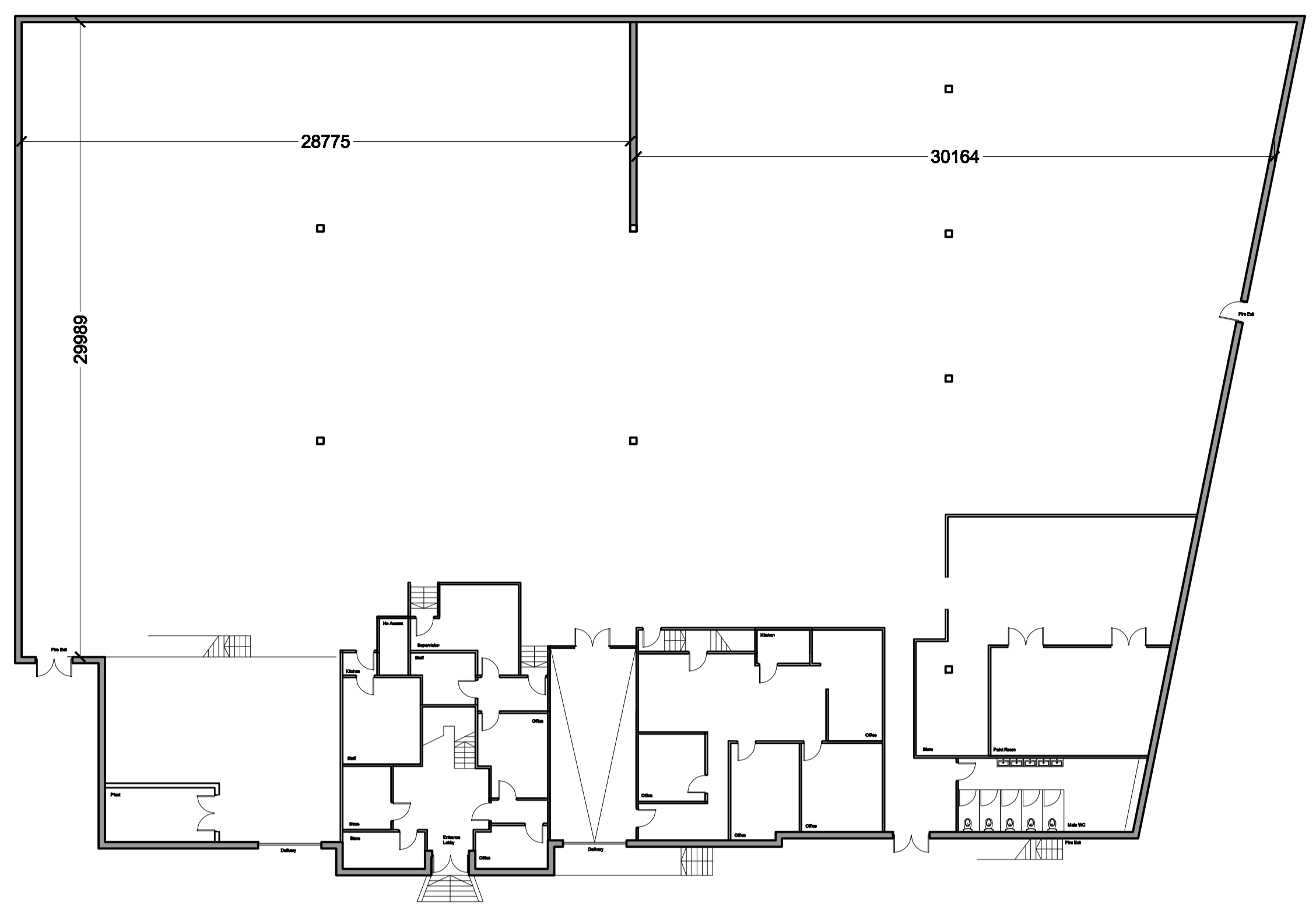
EXISTING GROUND FLOOR LAYOUT 1: 200 @ A1

NOTE Responsibility is not accepted for errors made by others in scaling from this drawing. All construction information should be taken from figured dimensions only. All dimensions should be checked on site prior to the manufacture of any components